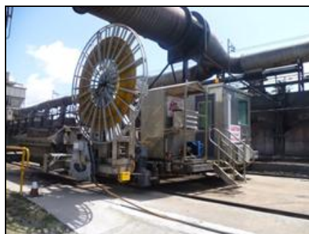
Figure 3: New Hot Car in operation