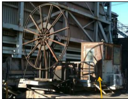
Figure 1: Old Hot Car

The new Hot Car continues to operate efficiently to this day.